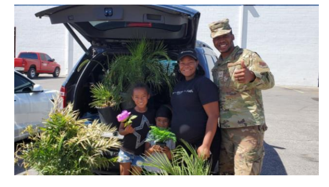
A special thanks to the folks at the Speedway for allowing us to use their space